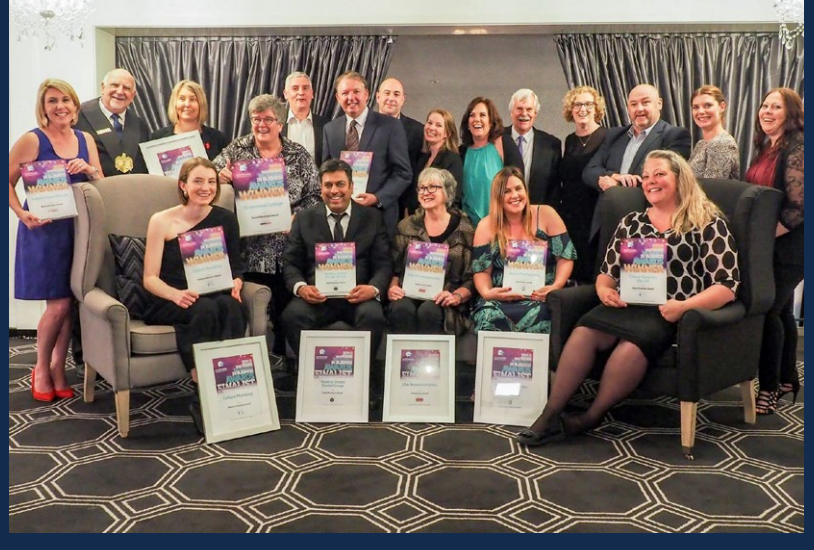
2018 Whitehorse Excellence in Business Award Winners

The awards invite organisations to stand out from the competition, to recognise staff for their contributions and proudly exhibit their successes.